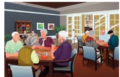
© Can Stock Photo - csp26053610

music, cards exercises, Friends, laughs, conversations.